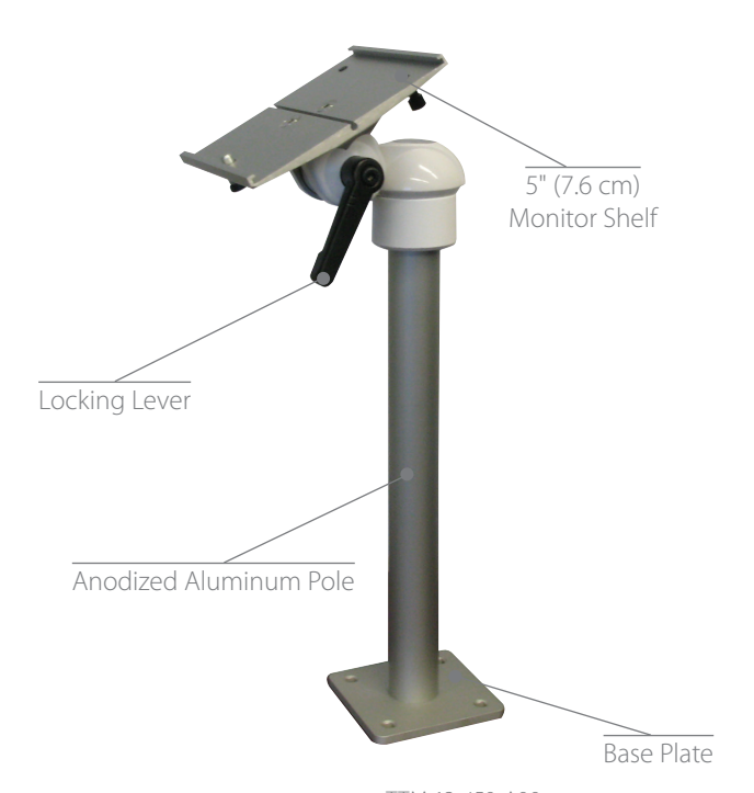
Part Number: TTM-12-450-A00